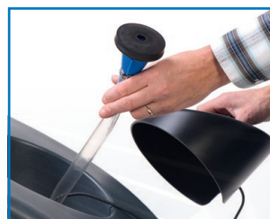
Optional: Filling hose