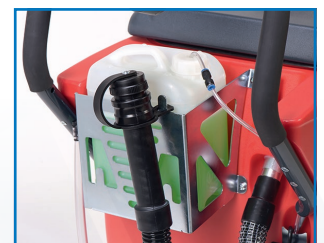
Retainer for 5 l canister