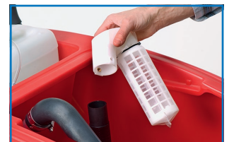
Floater with filter