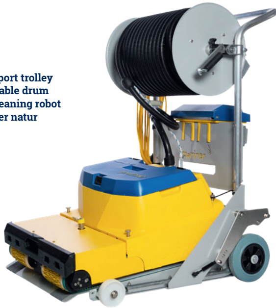
Transport trolley with cable drum and cleaning robot proliner natur