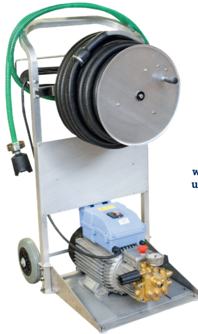
Transport trolley with high pressure unit, high pressure floating hose and suction hose