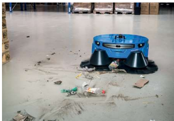
Cleans even coarse dirt

No additional installations are required to operate the robotic sweeper. The intelligent navigation reacts to changing environments without orientation aids or pre-programming.