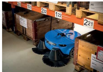
Cleaning in the pallet warehouse