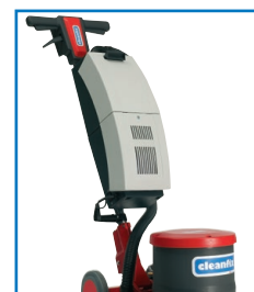
Easy mounting of the suction unit (optional)