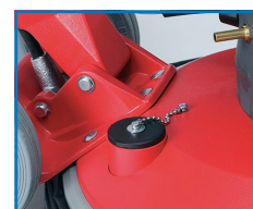
Connecting piece for suction unit