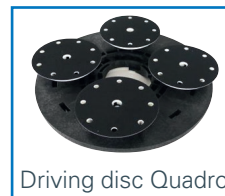
Driving disc Quadro