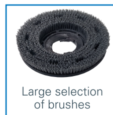
Large selection of brushes