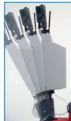
Fully adjustable telescopic handle, optional with solution tank