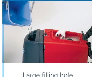
Large filling hole

RA501 B: without charger RA501 IBC: with integrated charger