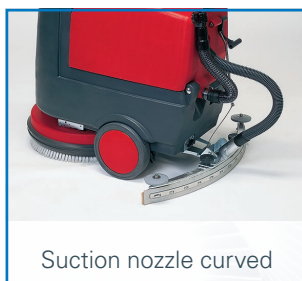
Suction nozzle curved