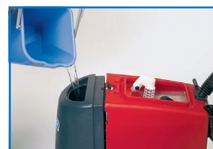
Large filling hole