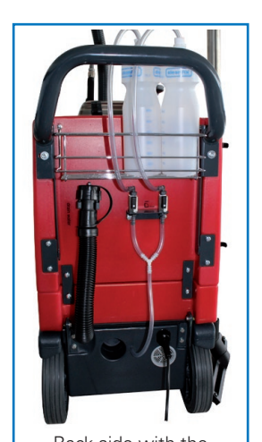
Back side with the emptying hose and the switches for the chemicals