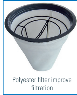
Polyester filter improve filtration