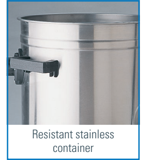
Resistant stainless container