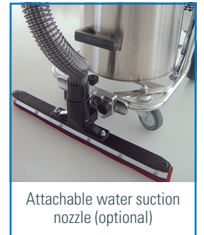
Attachable water suction nozzle (optional)