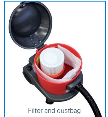
Filter and dustbag